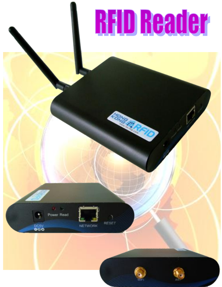
EMPRESS™ 2.4GHz Active RFID Reader (P/N: HKRAR-EMWF)